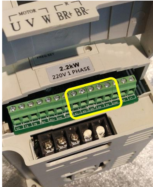
Fig.1 Find control input terminal X1,X2...X5 & COM under the bottom cover